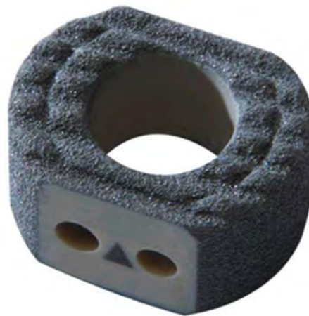
Figure 1. The CeSpace XP® Titanium-coated PEEK cage.

The statistical evaluation was performed using SAS Software version 9.4 (SAS Institute Inc., Cary, NC, USA). Statistical analysis of age and gender was performed by Student's t-test. A p-value <0.05 was deemed as statistically significant.