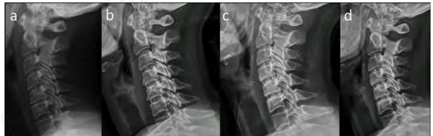
Figure 2. Patient with a bisegmental fusion: a) preoperatively, b) directly postoperative, c) after 5,5 months, and d) after 12 months.

We present a prospective study that intended to re-examine patients being operated for ACDF with cervical stand-alone TTN-coated PEEK cages in the past. The purpose of this investigation was to get more information on the clinical and radio-