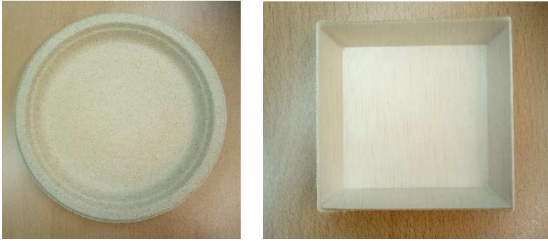
Figure 1. Wheat pulp and wood dishes studied.