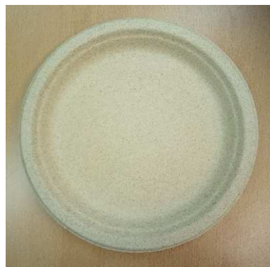
Wheat pulp dishes