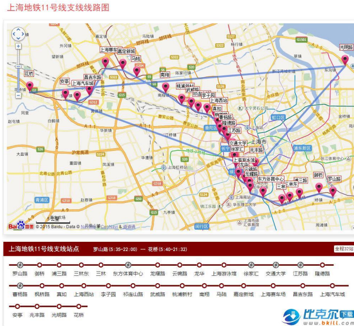
Metro Line 11