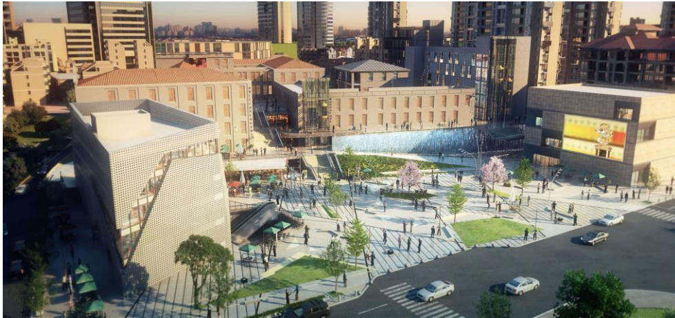
Huanshang university cultural and creative industry cluster