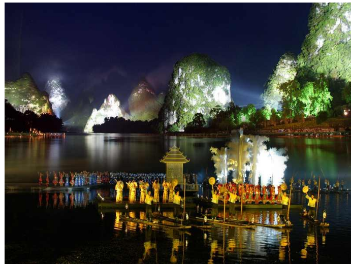
Impression Sister Liu

It contributes to promoting economic development, improving the employment rate of residents, film and television shooting and the resulting tourism effect. The most intuitive benefit is the growth of local economy (Liu and Liu, 2004). In the film shooting process, whether it is the rental of the shooting sites or the daily consumption of the crew's meals and accommodation, it can bring a