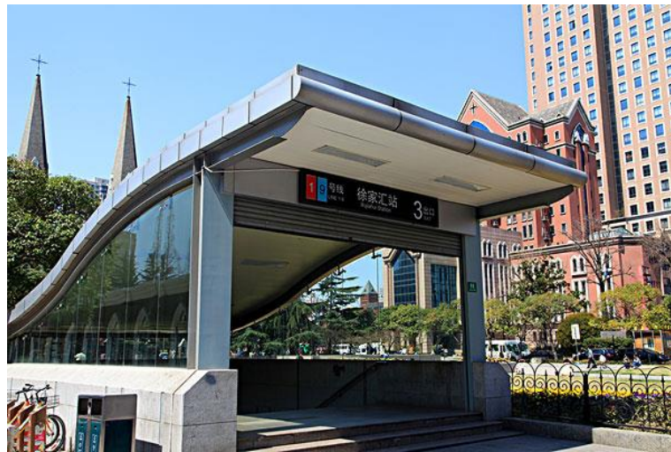
Xujiayuan subway station