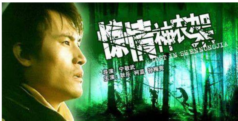
Jing Qing Shennongjia