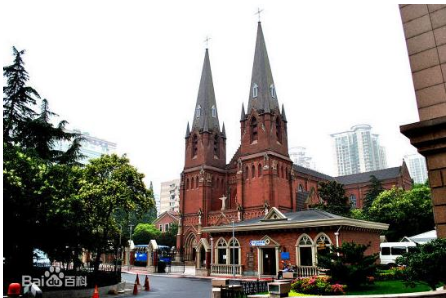
Xujiahuiyuan scenic spot (Source: 徐家汇源_百度百科 (baidu.com) )