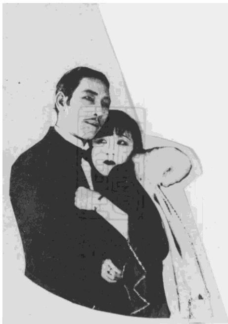
Pearl Crown