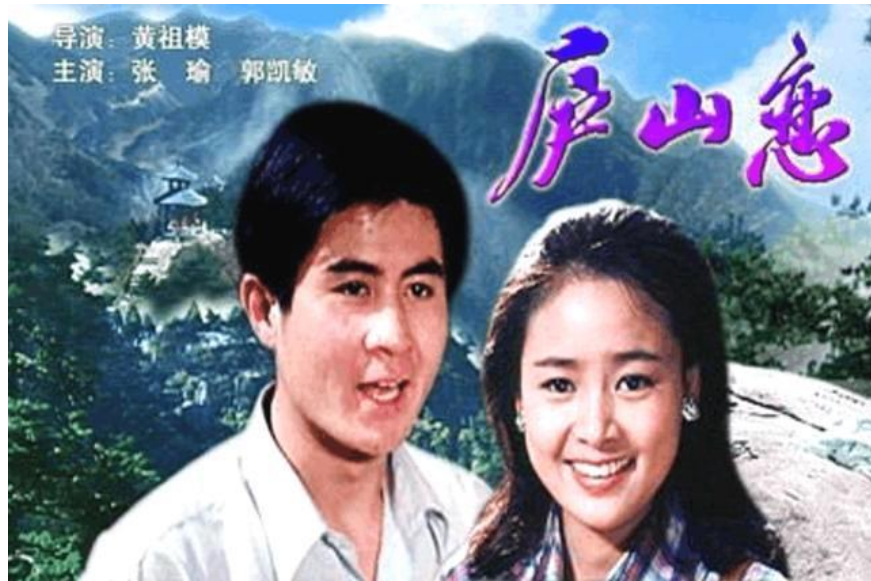
Love in Lushan Mountain