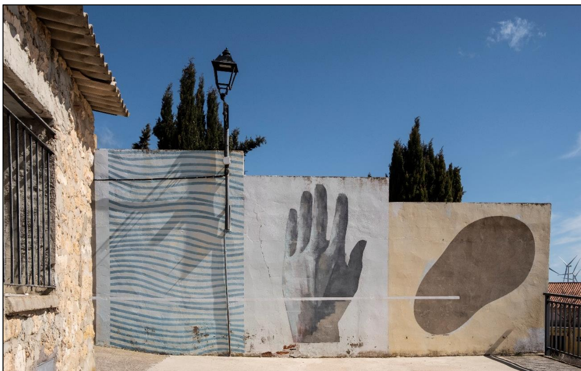
Figure 9. Agua, mano, vacío , Xabier Anunzibai (2017). Fuendetodos.