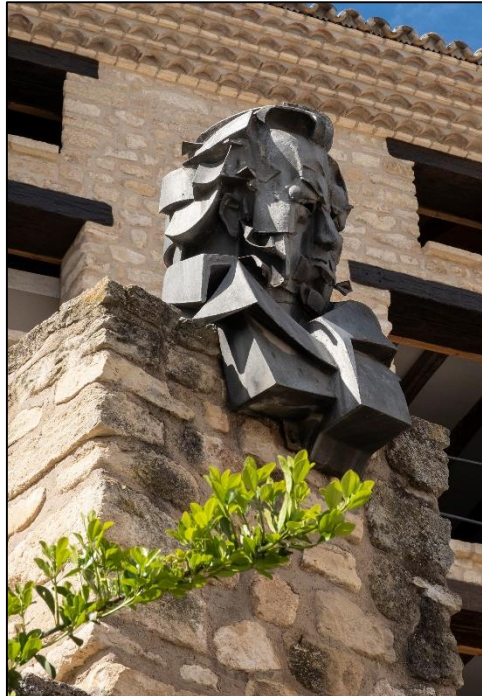
Figure 6. Bust of Goya , José Gonzalvo (1978). Francisco de Goya street, Fuendetodos

depicted standing next to one of the figures of his painting Los Fusilamientos (De Lecea et al., 2009).