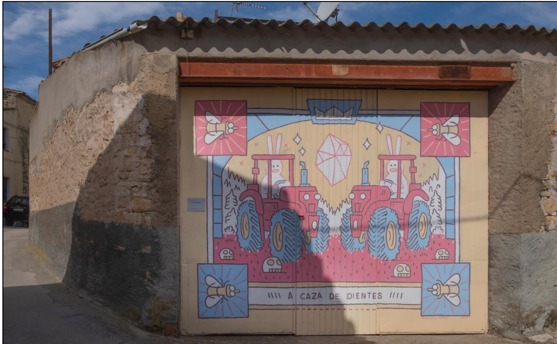
Figure 8. A caza de dientes , Álvaro Ortiz (2017). Fuendetodos

zoomorphic creatures who drive tractors and uproot teeth from the earth. Modern techniques, the exploitation of the land and the labour referred-to by the artist through the bees involve new forms of a relinquishment of rationality (Figure 8).