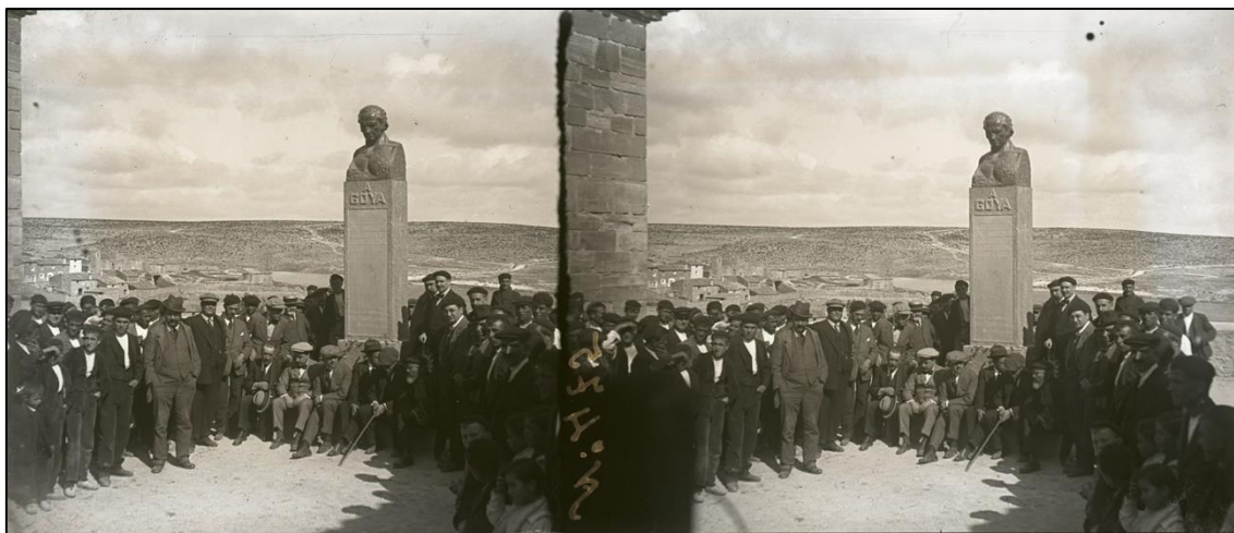
Figure 5. Grupo de amigos de Zuloaga que contribuyeron en el monumento a Goya (1920's)