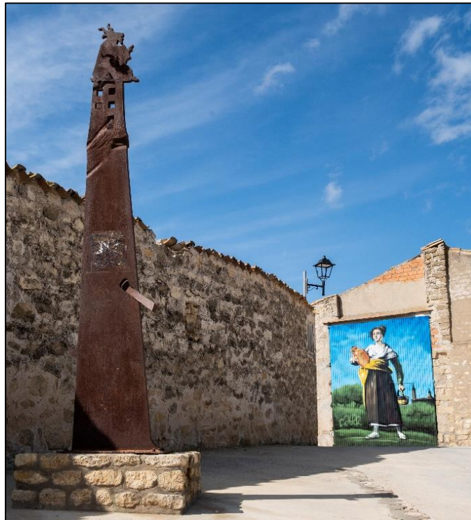
Figure 7. El Aquelarre , Yigal Tumarkin (1999). Fuendetodos