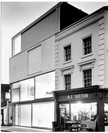
Figure 4. Lisson Gallery, London, 1992, Tony Fretton.

By including the outside activities—what is happening in the street—the façade becomes connected to our everyday experience, giving a specific form to Fretton's interest in what buildings can show. The reflections of the adjacent buildings make us more aware that the windows of the gallery are defined by lines based on the woodwork of the neighbouring 18th-century house. The articulation of the façade to stimulate our visual perception of the surroundings shows Fretton's interest in the role of images in the relationship between work and observer. This work also exemplifies the relationship that interests Fretton between architecture and the city: an interest in the existing and the given, and not so much in urban planning based on the generic approach of posing problems and solutions. His architecture shows we can understand what already exists as a gift from the city; a sum of deposited layers of the city's culture, the remains of its construction and existence. This relationship with the given however, does not take place in historical terms, because any architecture, irrespective of the age, returns as part of the present. Therefore, although certain buildings refer to a historical style from the past, its functions and effects talk to us about the present.