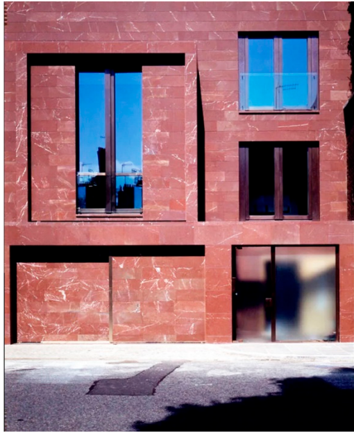
Figure 5. The Red House, Chelsea, London, 2000, Tony Fretton.

What is true in the windows is also true in the rooms. The living room located on the piano nobile , with its high ceilings and large dimensions, acts as a kind of exhibition hall for the collection of paintings and sculptures, with no other purpose than for the observer to experience the works and their spatial context. This space is autonomous from the other rooms; it does not follow the same spatial logic that defines the rest of the inside or a functional logic, or a specific representation of the functions. At first sight, this autonomy produces a certain surprising effect, although, later, the elements (large windows, fireplace, etc.) take us back to the neighbouring Victorian properties.