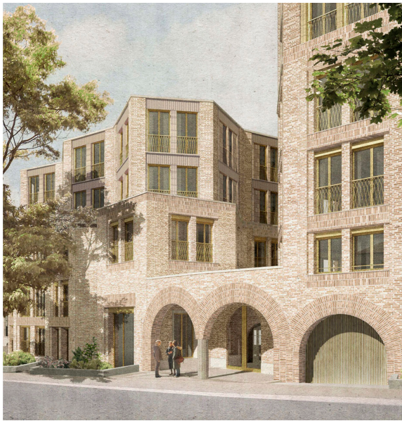
Figure 2. Mansion Block, Hampstead, Sergison Bates, 2017. © Sergison Bates.

Access to the dwellings is through a sequence of spaces conceived as a sum of scenarios that represent the moment of arriving home. The emphasis on this transition between the public and private sphere can be seen at the moment when the domination of the street ends and the home's power is yet to begin. The idea of comfort conveyed by homes is related to this sum of layers; protective layers such as the sum of successive thresholds between the street and the dwelling—which are required in order to feel at home. Sometimes, the danger of comfort lies in an excessive isolation that leads to loss of feeling. To deal with this, Sergison Bates adds elements connected to the known in each transition area: "familiar" doors, windows and handles that trigger and heighten our visual associations. The idea of comfort, therefore, is not only based on a warm, safe setting, but also on the reproduction of the known and the familiar; a comfort that is neither purely physical nor totally psychological.