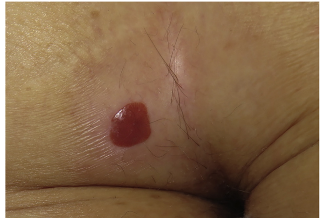
Figure 1 Well delimited erythematous shiny plaque on the left buttock, surrounded by a hypopigmented area.

On dermoscopy CCA is highly characteristic, showing dotted or glomerular vessels arranged in a linear or serpiginous