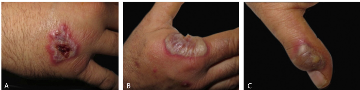
Figure 2 Detail of individual lesions of neutrophilic dermatosis of the dorsal hands (A), Crusted violaceous plaque (B), Large blister with an erythematous base on the radial aspect of the right hand (C), A lesion with purulent discharge over interphalangeal joint of the left hand.

NDDH is currently considered an uncommon, localized variant of SS. 4 Clinically, NDDH is characterized by erythematous-violaceous plaques and nodules, frequently ulcerated, predominantly involving the dorsal hands. 4 This disorder has a predilection for the radial aspect of the hands and is generally bilateral. 5 The localized distribution, clinical features and neutrophilic infiltration often lead to the initial diagnosis of cutaneous infection. However, the lesions do not respond to antibiotics and cultures are negative. 4