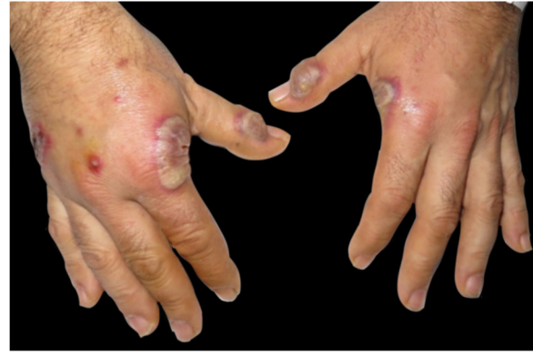
Figure 1 Clinical presentation. Erythematous-violaceous plaques, pustules, and bullous lesions on the dorsal hands.

The patient was treated with oral prednisone 30 mg daily in a slow-tapering regimen for 8 weeks, along with topical betamethasone/gentamicin cream. Steroid therapy induced a dramatic response of both cutaneous lesions and thoracic pain. Moreover, the patient achieved to stop using cocaine since hospitalization to this day. During 1-year follow-up, no recurrence of the cutaneous lesions was observed, and the patient remained completely asymptomatic.