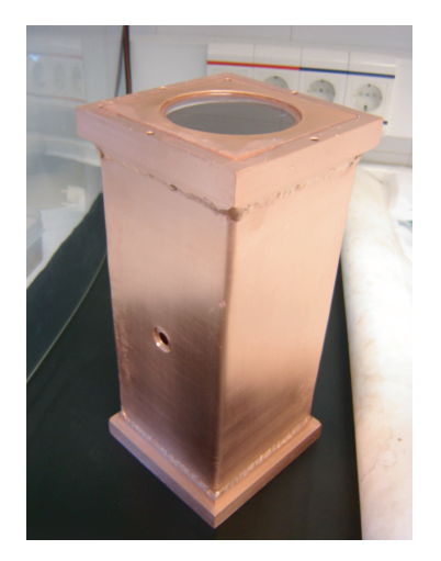
Figure 2. One of the ANAIS prototypes.