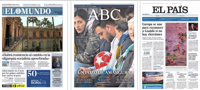
Figure 3. Newspapers' front pages on January 27, 2019

on the three papers' cover models, it is observed that El País devoted 25% of its front page to Julen's case on January 26 and January 27; El Mundo displays the story on 35% of its front page on January 15 and it occupies a smaller space on January 20, 26 and 27; ABC only grants Julen 100% of its one-story cover on January 27, although the news was covered on page two on several occasions. In order to measure the relevance of the story, we have followed a Z-shaped reading pattern, considering the upper sections as more relevant than the lines lower down, and the left side as more relevant than the right. By dividing a front page in four quarters and following the Z-shaped pattern, it can be observed that, on January 15 El País placed Julen's case on the lower-left quarter of its front page. El Mundo granted its upper-left quarter to Julen on January 26 and the lower-left quarter on January 27, while El País displayed the information on its lower-right quarter on January 17 and on its upper-right quarter on January 26 (Figure 3).