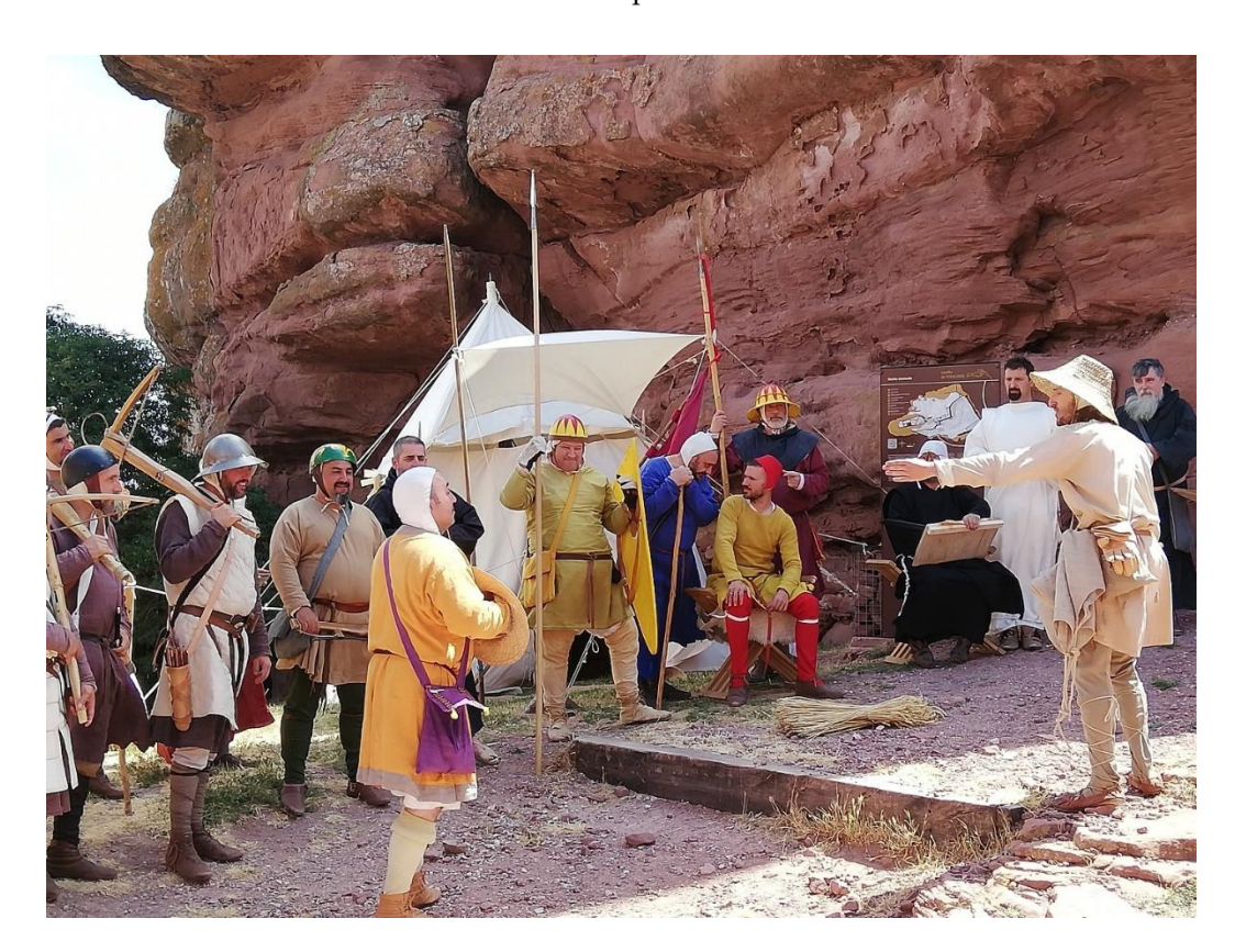
Figure 1. Medieval reenactment in Aragón, Spain.

Besides this general approach to certain methodological factors, we must consider the advantages this cultural industry currently offers in non-formal settings, which are easy to include in any historical and heritage education program. There are now hundreds of Spanish and international historical reenactment projects combining all the necessary factors to construct an educational event, as outlined above (Figure 1). When planned in advance by teachers, they can be visited by groups of schoolchildren and form part of educational material and practice. Many of these projects are designed to offer a wide range of didactic possibilities, since they are suitable for a variety of audiences with differing educational levels. Some examples are outlined below.