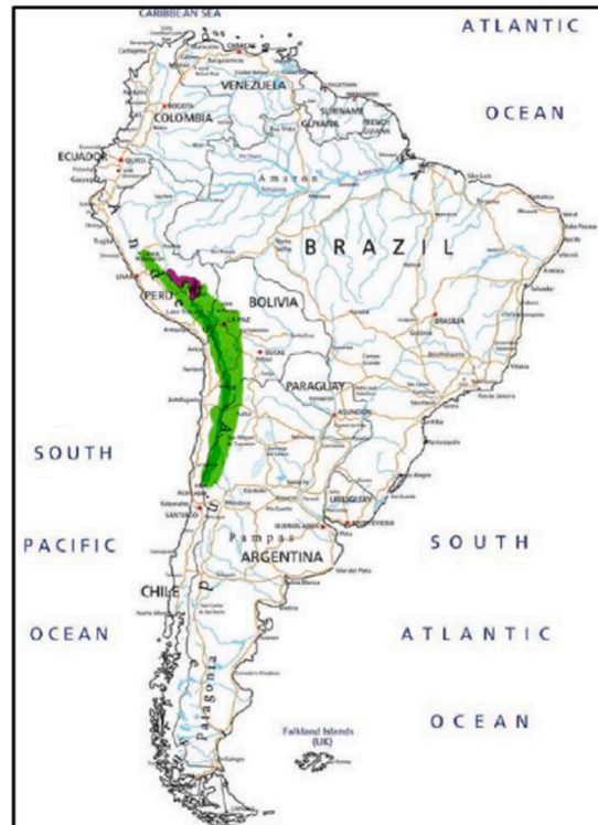
Fig. 1. Distribution of populations of llamas, guanacos, alpacas and vicuñas in South America. The areas shaded in green indicate the current distribution, while those shaded in purple indicate the pre-Hispanic original distribution, both shaded areas indicate the original distribution for each of the four species. In the case of llamas and alpacas, their current distribution is due to the fact that they are still part of the way of life of Andean communities because they have not been displaced by other domestic species (i.e. sheep and cattle) or other economic activities (i.e. tourism, agriculture, industry or migrations to the city).

Modified from McLean and Niehaus (2022) .