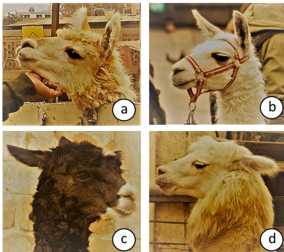
Fig. 3. Ear and head position are predictors of HAR in SADCs. a) Positive tactile interaction human-alpaca; b) Neutral interaction with humans, note the ears and head of a llama in surveillance position; c) Anxiety and fear in a young alpaca prior to handling; and d) Warning signs prior to defensive aggression by spitting in an adult alpaca.