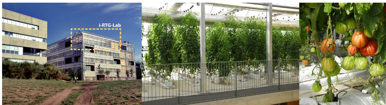
Fig. 1 ICT-ICP building (left), inside of the i-RTG-Lab (middle) and experimental tomato crop (right)

In order to fully and thoroughly assess the environmental impact of the two samples (A and B) of the new material three main aspects were investigated. Precisely, other than performing a classic Life Cycle Assessment (LCA), it was decided to also estimate the carbon footprint and the embodied energy indicators (that are based on the LCA methodology as well), for a dual scope as better explained in the following. Specifically, the carbon footprint and embodied energy indicators were chosen mainly for the purpose of making a comparison between the new material and some other conventional (non-natural-based) most commonly