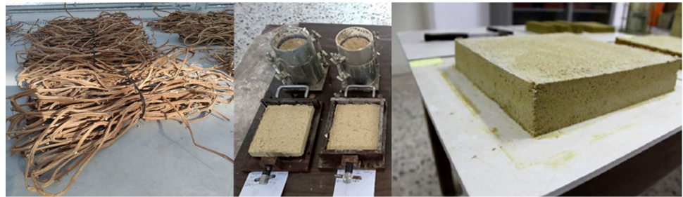
Fig. 3 Tomato plant stems (left) used for the production (middle) of the new infill wall material (right)

characterized by different properties and densities and, consequently, the total mass to achieve the FU varied for each of them. That is, for the same fixed value of thermal resistance (as reported in Sect. 2.2.2), in sample A it was decided to enhance mechanical characteristics, while in sample B it was decided to enhance thermal characteristics. Therefore, FU of sample A is characterized by larger thickness and heavier weight than FU of sample B. To do this, the composition of the two samples was made to vary as shown in Table 1. Nevertheless, it should be stressed again that, since the new bio-composite material is intended to be used as a sustainable alternative to other most commonly used building envelope infill components (i.e. hollow bricks, tuff blocks and light concrete blocks), both samples are able to meet the minimum characteristics required for such a type of building element.