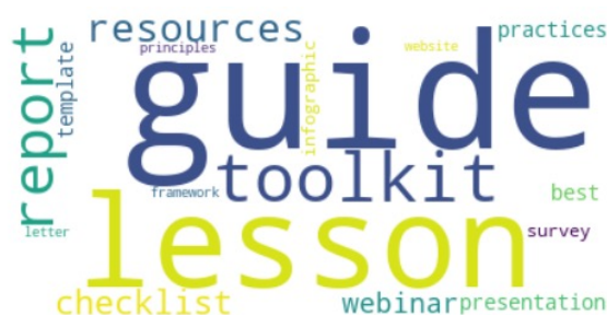
Figure 1 Word cloud of the types of resources

As shown in Figure 2, documents comprise most of the content at 47.9% (70 out of 146). Documents account for the highest proportion, indicating their significance as a prevalent medium for information dissemination. Following documents, websites make up 34.2% (50 out of 146) of the content. This indicates that websites play a substantial role in providing valuable information and resources to users. Videos comprise 16.4% (24 out of 146) of the content, highlighting their significance as an engaging medium for educational purposes. Lastly, images constitute a smaller portion, only 1.4% (2 out of 146) of the total content. This suggests that images are less commonly used compared to other forms of media for conveying information. These statistics emphasize the diverse range of content formats available and their varying levels of popularity in online resources.