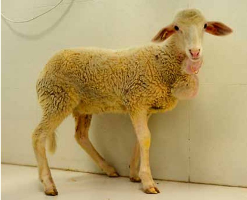
Fig. 1. Five-month-old lamb with cervical protuberances.