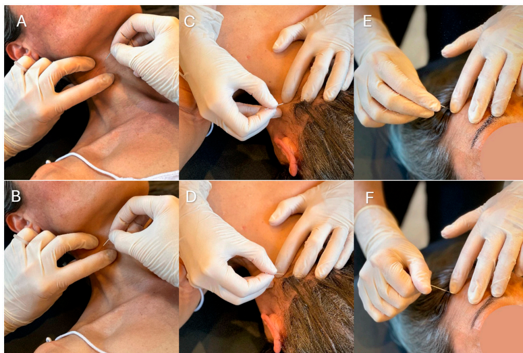
Figure 2. Demonstration of dry needling technique in different muscles. (A) Outward needling of the sternocleidomastoid muscle. (B) Inward needling of the sternocleidomastoid muscle. (C) Outward needling of the obliquus capitis inferior muscle. (D) Inward needling of the obliquus capitis inferior muscle. (E) Left rotation needling of the occipitofrontalis anterior muscle. (F) Right rotation needling of the occipitofrontalis anterior muscle.

The DN technique was applied directly to the AMTrP, aiming to reproduce all local twitch responses elicited by the AMTrP following the methodology described by Travell and Simons [20]. The techniques applied were as follows: in and out needling or needle winding in muscles with a large-diameter muscular belly and no nearby dangerous structures, and the bidirectional rotation technique was employed in muscles with a very flat muscular belly (such as the temporalis, occipitofrontalis posterior and anterior, and zygomaticus major muscles), and those with structures like blood vessels and nerves nearby (rectus capitis posterior major, obliquus capitis superior and inferior) (Figure 2).