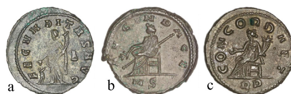
Figure 8: Radiate reverses of Salonina depicting Fecunditas (a), Concordia (b) and herself (c). Not to scale

The virtues of Salonina reflected in the sole reign of her husband are composed of pudicitia and, in a much smaller percentage of cases, pietas . Aequitas , indulgentia , and providentia have a merely anecdotal presence. If we look at the previous period, we can observe how pudicitia and pietas changed positions. While the piety of Salonina was the most noticeable virtue depicted during the joint reign of Valerian and Gallienus, related to her dynastic representation, modesty becomes the most important virtue during the sole reign of her