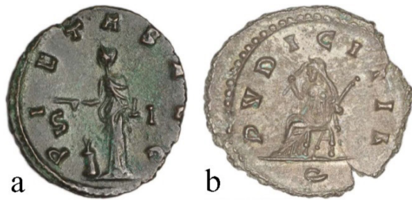
Figure 9: Reverses of antoniniani of Salonina with the image of Pudicitia (a) and Pietas (b) (© The Trustees of the British Museum, n. R.933 and 1961,0805.285 respectively). Not to scale

husband (Fig. 9: a). In addition, all the types related to Salonina's pietas are associated during the second period not with the imperial family, but with her piety towards the gods, as the personification of virtue is presented next to an altar, sometimes veiled and usually with a box of perfumes (Fig. 9: b) 23 . Moreover, regarding the virtues presented on the coinage of Salonina, Balbuza (2019: 15) states that liberalitas was «the theme of imperial coins minted in the second half of the third century» for her, although there is not a single specimen in the more than 14,500 coins analysed. This is an eloquent example of the difference between commemorative and frequent coinage and supports the methodology of studying coin hoards.