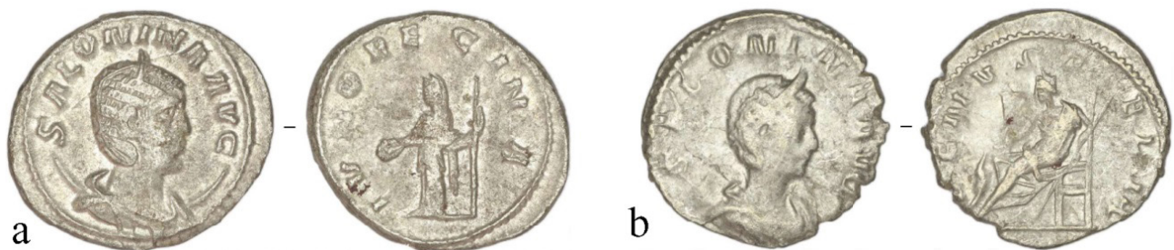
Figure 4: Radiate of Salonina depicting Juno Regina . (© The Trustees of the British Museum (a), n. 1983,0101,830.1) and Venus Felix (b) (© The Trustees of the British Museum, n. 1983,0101,733.1). Not to scale

With a brief look at her categories in the period 260-268 we can see an evident change in the representation of Salonina. The substantial divine association of the previous period moves aside to allow a stronger dynastic representation on 35% of the coins, followed by a reflection of her virtues on slightly more than 20% of them. However, more than 40% of her coins depict a divine association. The divinities of this period