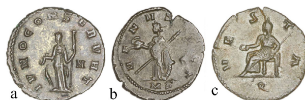
Figure 7: Reverses of radiate coinage of Salonina with references to Juno Conservatrix (a), Venus Victrix (b), and Vesta (c) (© The Trustees of the British Museum, n. R.1694, R.928 and 1933,0202,132 respectively). Not to scale