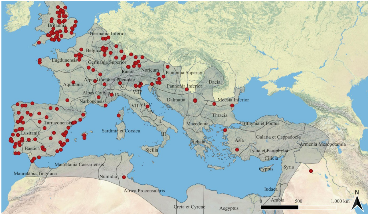
Figure 1: Location of the coin hoards considered for the analysis

on her coinage, it is useful to outline here how she was depicted in the epigraphy. She always appeared as Augusta , 3 in most cases as coniuge or uxor of Gallienus, 4 in a smaller number as sanctissima , 5 and in some depictions as Mater Augustorum , 6 Mater Castrorum , 7 and even as Mater Castrorum, Senatus ac Patriae . 8 Taking this into consideration along with the widespread use of these titles, we can assume that she had an important role in the distribution of the image of the imperial family, at least through the inscriptions. Also, although these appear in a relatively small number of examples, she held the titles of Mater Castrorum , as did Faustina II, Iulia Domna, Iulia Mamaea and Iulia Maesa (Kettenhofen, 1979: 145); Mater Augustorum as the mother of Saloninus and Valerian II, and as Soaemias