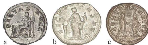
Figure 5: Reverses of radiate coinage of Salonina with references to Pietas (a), Fecunditas (b) and Concordia (c) (© The Trustees of the British Museum, n. R.763, 1983,0101,757.1 and 1983,0101,876.1 respectively). Not to scale