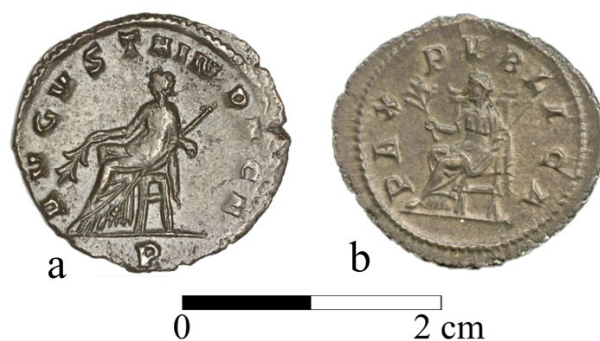
Figure 2: Reverse of radiate of Salonina with the legend AVGSTA IN PACE (a), and reverse of denarius of Pupienus depicting the personification of Pax (b)

Considering a sample size of more than 105,000 coins from 121 coin hoards, in which more than 14,500