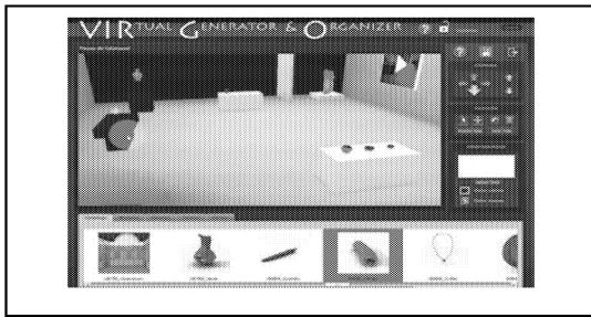
Figure 2. The virtual exhibition room of VIRGO.

This second environment gives VIRGO 1.1 a more constructive perspective because it allows a high level of interaction, very much like a microworld. Once the exhibition has been built, you can see it in the third environment, where VIRGO becomes a virtual museum [10]. Here students can show their work as if it was a virtual public exhibition. Therefore, any person can go through the display just like a virtual museum, similarly to a MuseuVirtual authoring tool [11]; however VIRGO 1.1 is a VIRtual Generator and Organiser . As a result, making the exhibition becomes a learning activity which “is not limited to a visit to a museum created by a third party; rather, it consists of the actual individual or collective construction” [11]. A much more recent tool similar to VIRGO is ClarkRemix™ with uCurate