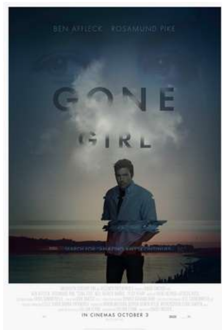
Figure 1: Gone Girl 's official theatrical poster

Based on Gillian Flynn’s global bestseller Gone Girl , the film entitled Gone Girl was well-received by both critics and spectators. It made more than $368 million, which makes it the highest grossing film by David Fincher (“ Gone Girl (2014)”).