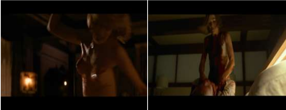
Figures 7 and 8: The first is a shot of the female psychopath killing her first victim at the beginning of Basic Instinct ; the second is the shot of Amy killing Desi in a similar manner.

At this point in the film, Amy cannot be redeemed and the changes and sacrifices that she had to make once she married are forgotten. In this post-feminist world, she has been asked “too much” all her life, just as Faludi states in her preface to the fifteenth year anniversary version of Backlash (xv), and in her attempts of satisfying these demands she has progressively lost herself but the audience no longer considers this loss relevant. Amy has been demonized, first because of her lies to the spectators (through her diary), then because of the shocking revelation of her plan and, finally because of her killing of Desi. Her demonization does not stop there but continues when we see her forcing Nick to stay with her at the end of the film because of her pregnancy. In this way, Nick, the man’s whose sinister words opened the film, has been completely exonerated and he is now the victim controlled by his wife, the evil psychopath. Thus, the next point of the essay deals with the victimization of Nick in order to illustrate the way in which the masculinity crisis, an element of the backlash since the 1980s (Faludi, Backlash 134), is presented in this film.