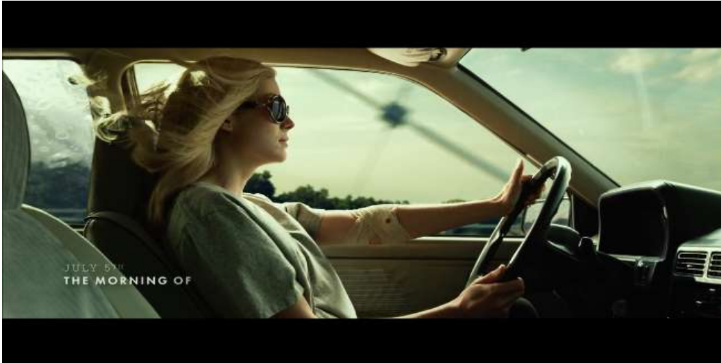
Figure 3: A shot of Amy driving away on the day she went missing. This is the beginning of Amy's "cool girl" monologue in which she confesses her plans to frame Nick.

In this monologue, we see her throwing away the different toy pens she used to write the diary, an action that is not without connotations. With her toy pens she is throwing away symbols traditionally associated with the female world: a baby-carrying stork (motherhood), a bride and a groom (marriage) and a pink pompom (femininity). Her act of throwing them out of the window represents the end of her former life with Nick and, as she claims; once her plan is executed "Nick and Amy will be gone". At this moment we have another surprising turn when she says "But then, we never really existed", which makes the audience think that nothing we have seen or heard of Amy is true, that she had been faking both her personality and her relationship with Nick. As she puts it: "Nick loved a girl I was pretending to be. Cool girl", then she explains how she built this image up to attract Nick because men like Nick like this type of girl, the cool girl.