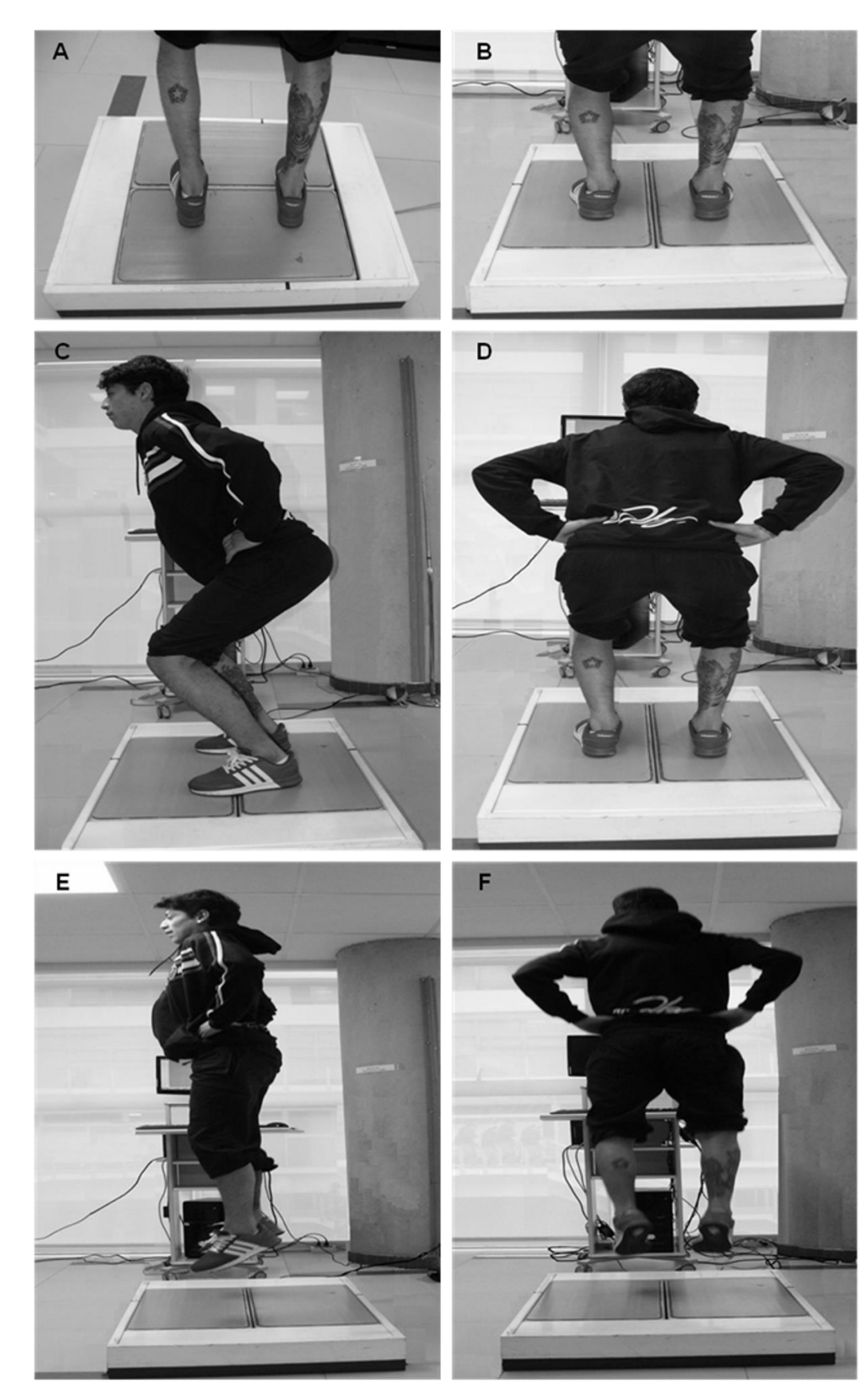
Figure 1. Positions for executing the squat jump by using COBS® Feedback