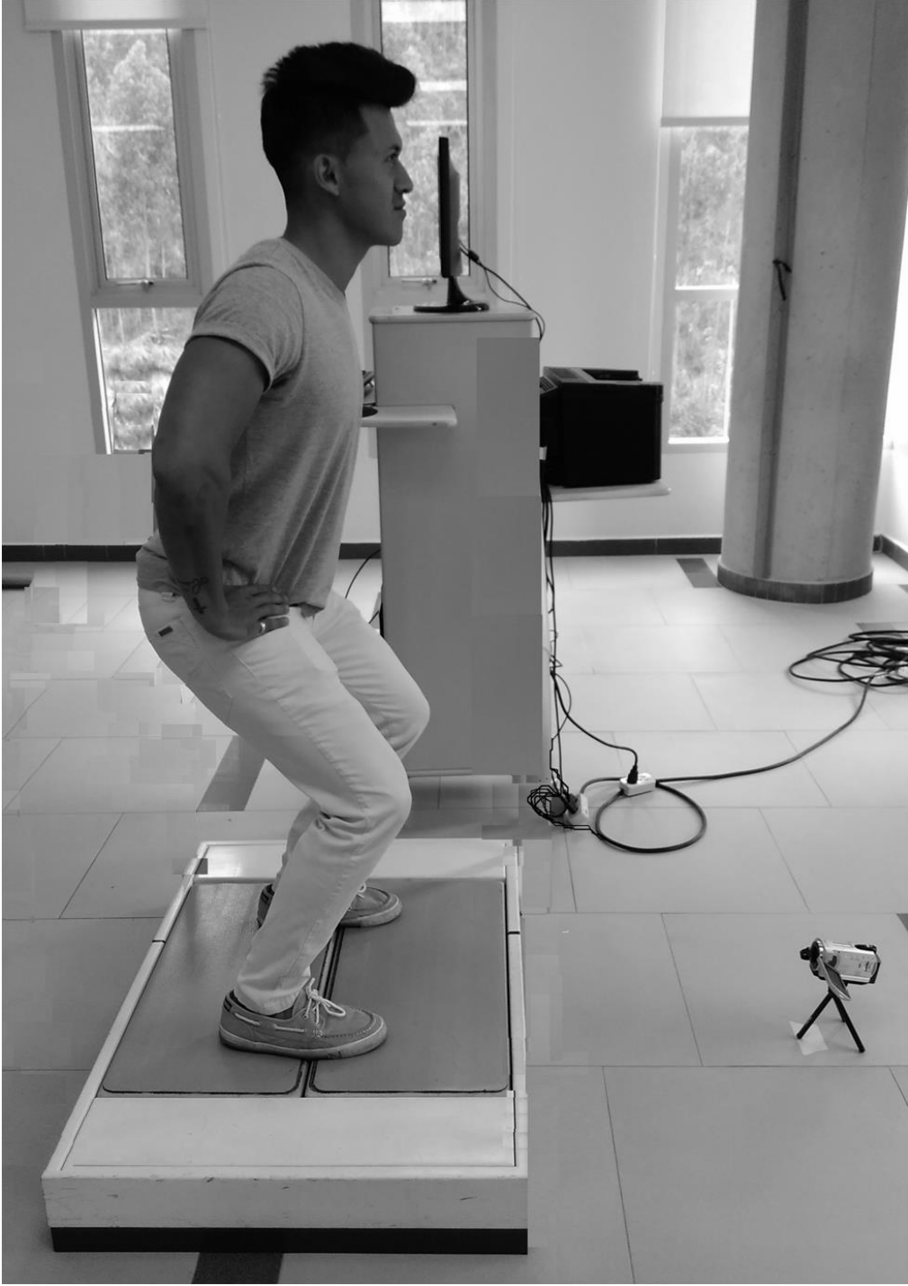
Figure 2. Positions for record the squat jump by using HSC-Kinovea method

To simulate a field-training situation of the HSC-Kinovea method, recording was performed under nonprofessional conditions. Thus, no multi-camera and lighting systems were used for the recording. To capture a close-up of each subject's feet, a tripod was used holding the camera at 1.0 m from the platform and oriented in front of the sagittal plane of the subject being assessed in the COBS Feedback<sup>®</sup> (figure 2). The testing environment was designed such the two systems simultaneously measured the flight time.