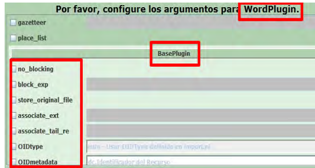
Fig. 2. Lack of detail on format configuration panel