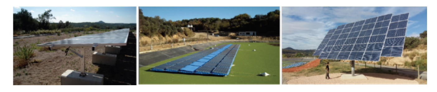
Figure 5. The three photovoltaic arrays: fixed, floating and solar tracker.