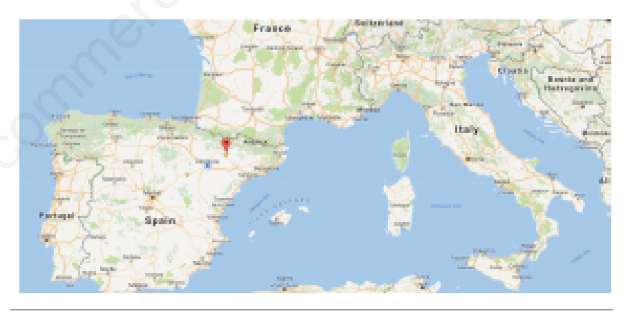
Figure 4. Location of the prototypes.

Regarding energy storage, a set of leadacid batteries takes care of short-term storage. Since long-term battery storage is not technically and economically feasible, the prototype of the vineyard has been chosen to use surplus energy in the production of hydrogen by electrolysis of water, separating hydrogen from oxygen. Much of the energy used for it can again be recovered by the reverse process, combining hydrogen with oxygen in a fuel cell. In this way, the surplus energy is stored as hydrogen, in a high pressure tank. An allterrain electric vehicle has been transformed by incorporating a fuel cell, hydrogen tanks