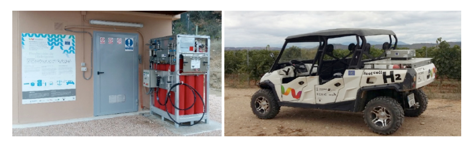
Figure 6. Hydrogen refuelling station and fuel cell vehicle.