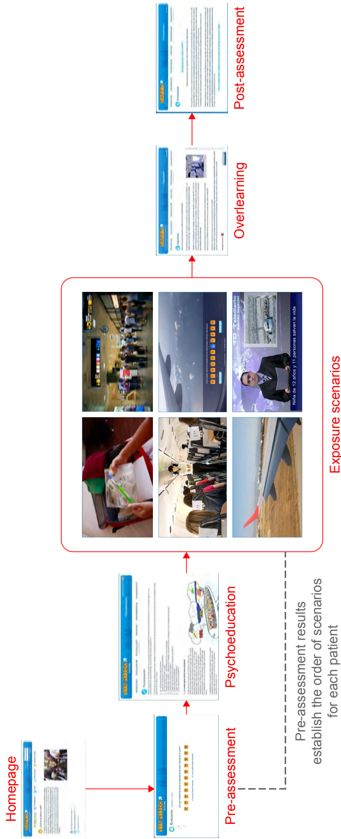
Figure 2 Navigation structure of the system.