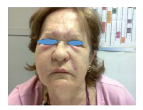
FIGURE 1: First visit to the Emergency Room. Erythematous plaques in supraciliary and malar areas.