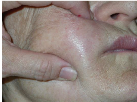
FIGURE 2: Granuloma 3 * 3 cm located in supraciliary area, right side.