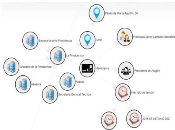
Figure 2: Browser for EI2A elements

In order to apply EI2A scheme on real data, the ontology has been populated. On one hand, EI2A has been populated with information related to the organizational chart of Government of Aragón extracted from spreadsheets. In this way, semantic information is added to indicate the nature of a person's membership of an organization, that is to say, that a person belongs to a unit or department with a specific role in a valid time interval. On the other hand, motivated by the need of automatic way to extract, structure and standardize information from the huge amount of textual content available on the institutional websites, EI2A ontology has also been populated with new instances of concepts and relations provided by the NERC process. For example, information related to a recognized entity (person, organization and/or location) has been cited on a web that is classified under a categorization of themes of the Government of Aragón is specified semantically, in addition to add data related to the summary, the url and the date of capture of textual web content. A browser through the ontological model EI2A is illustrated in Figure 2.