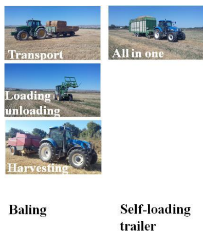
Figure 1: Logistic chains

A common data collection methodology was used during the harvesting tests to acquire the whole set of parameters foreseen in the harvesting tests.