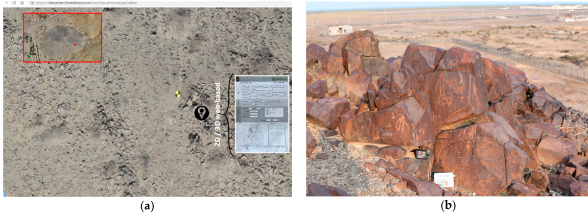
Figure 2. Example of a data base (a) through a web mapping linked to the different data (survey form field sketches, aerial and terrestrial pictures, 3D mesh, large point cloud, 360 immersive view, de-correlation view, etc.); (b) survey field texture documentation with a standardized colour chart.

C. Create and develop a web platform called threeDcloud [4] for visualising three-dimensional models and high-resolution images, allowing real-time interaction of the information. This web platform is based on potree , a free open-source WebGL to manage large point clouds [5], an open-source JavaScript library to adapt the orthophoto generated ( leaflet ), and a de-correlation view to analyse the 3D mesh of each Rock Art panel ( three.js , DStretch ).