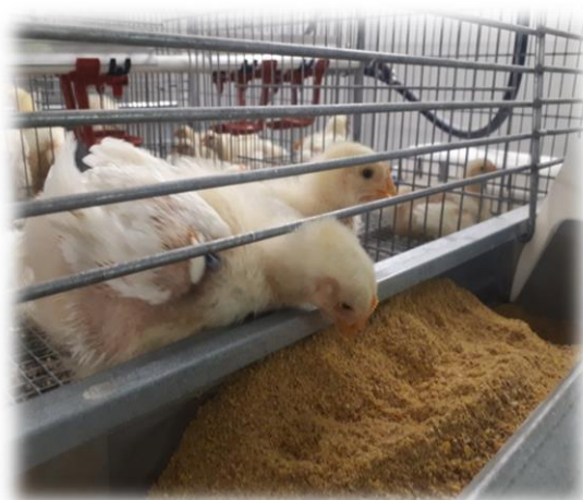
Figure 3.1.1. Seventeen days old female chicks.

Ninety-six female broiler chickens of Ross 308 strain (Pondex SAU; Lleida, Spain) were housed in the growing poultry unit, in particular, in 24 identical sized battery cages arranged in three floors, under identical controlled conditions ( Figure 3.1.2 ). The cage was the experimental unit.