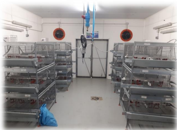
Figure 3.1.2. General overview of the facilities, where the study took place.