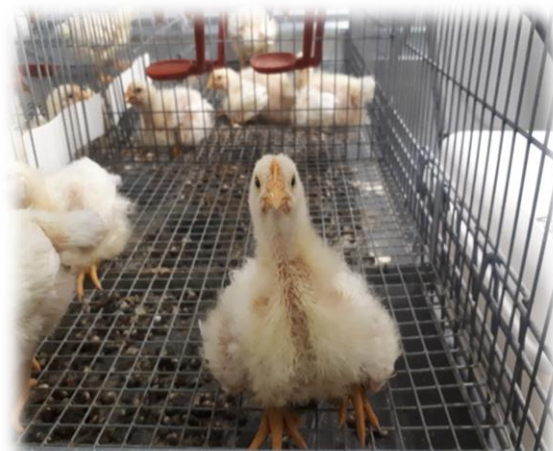
Figure 3.1.3. Fourteen days old broiler (Ross 308 stain) allocated in cage.