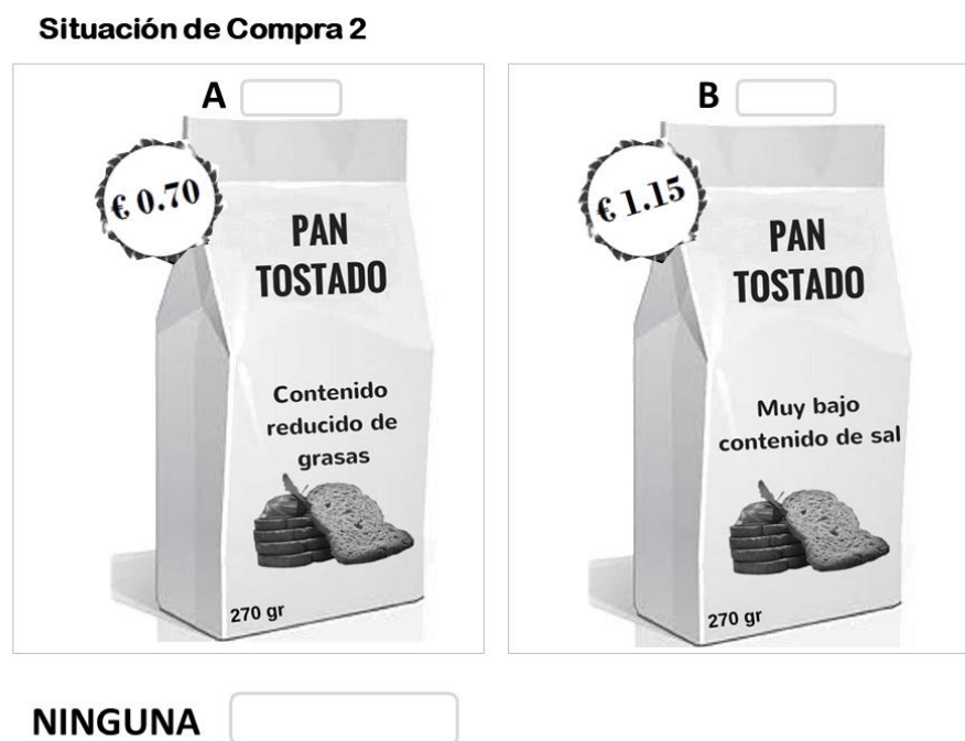
Figure 2. Example of a choice set.