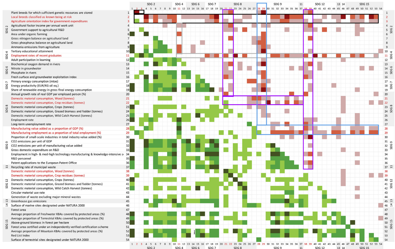
Fig. 2. Hotspots of synergies and trade-offs by pairs of bioeconomy-related SDG indicators

Note: To synthesise results on a single matrix, synergies between pairs of indicators are represented below the main diagonal and trade-offs above the main diagonal. Only cells where more than 50% of the pairwise correlations classified either as significant synergies (green) or trade-offs (red) and based on at least 60 data pairs are coloured. As a reminder, no causality inference can be made on this matrix, and accordingly, results have to be interpreted for the indicator pair (i and j) irrespective of whether indicator i is positioned in a row or in a column. (For interpretation of the references to colour in this figure legend, the reader is referred to the Web version of this article.)