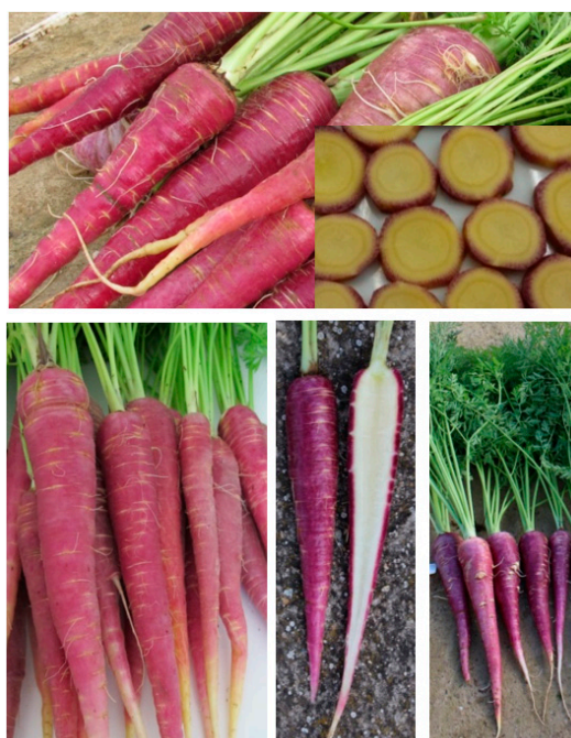
Figure 1. Picture of local purple carrots from the Maestrazgo presented to consumers.

Before the final questionnaire was distributed, a pilot survey was conducted with a sample of respondents ( N = 15 ) to test general understanding and response time. The final questionnaire was structured into four parts. The first part contained questions related to consumers' consumption and purchase habits regarding vegetables and carrots and on knowledge about carrots. In order to measure knowledge of carrots, an "objective knowledge" approach was used. Respondents were asked to indicate if five sentences related to carrots were true or false. The statements were: (1) carrots have vitamin A; (2) a carrot is a tuber; (3) carrots can only be orange; (4) carrots are high in antioxidants; (5) eating carrots helps preserve eyesight. Sentences (1), (4), and (5) are true, while sentences (2) and (3) are false. When an answer was correct, the sentence received the value 1, and the value of 0 when wrong. A summary index was created for the five sentences. Thus, the knowledge index ranged from 0 to 5. The second part asked respondents about the appeal of and their potential intention to purchase purple carrots after they were shown different pictures of purple carrots (whole and cut in slices) (Figure 1). They rated how much they liked the appeal of purple carrots using a 9-point hedonic scale from 1 (extremely dislike) to 9 (extremely like).