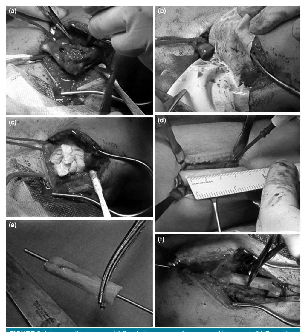
FIGURE 2. Intraoperative images. (a) Surgical exposure of aneurysmal bone cyst. (b) Resection. (c) Impregnation with lauromacrogol solution. (d) Subperiostal fibular graft measurement. (e) Placement of intramedullary titanium stem in autograft. (f) Retrograde-anterograde graft placement and stabilization under light compression.

en bloc resection without reconstruction of the bone defect. This option may be valid in older patients or patients with low functional demand, although we