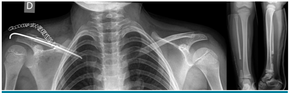
FIGURE 3. Immediate postoperative X-ray appearance.

believe that it should not be considered in children or adolescents due to the potential secondary functional limitation.