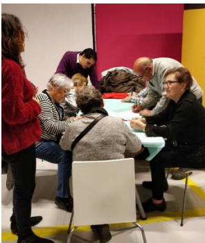
Figure 8. Talking and writing with the grandparents about the experience

players with the different missions. The game lasted one hour plus 15 minutes to talk with both age groups (separately).