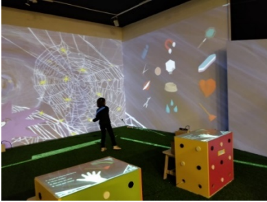
Figure 6. Freeing the stars mission