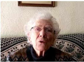
Figure 7. Pipo's grandma