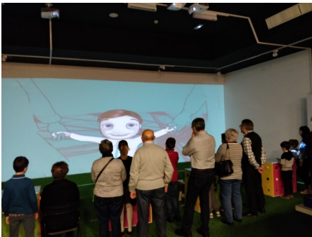
Figure 2. Meeting Pipo, the game main character