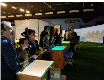
Figure 5. Planet of Indians mission