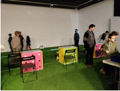
Figure 3. The search of the suitcase mission