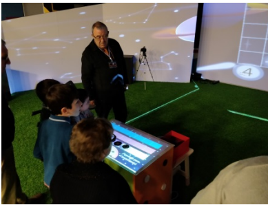
Figure 4. Starloop mission