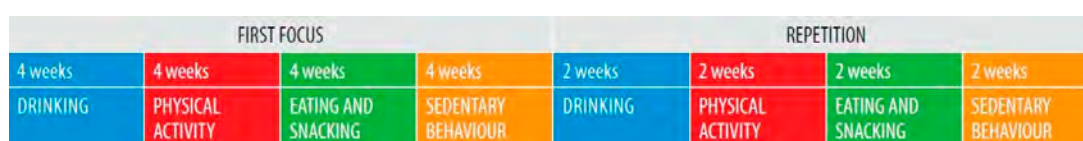
Figure 1. Flow of the 24-week ToyBox intervention.

Preschool children received two newsletters, two tip cards, and one poster, with the aim to engage the parents/caregivers. The newsletters and tip cards contained tips and strategies to promote the consumption of healthy snacks in preschool children (e.g., making the fruit and vegetables available every day, not eating in front of television). All the materials are available on the website of the ToyBox study [25].