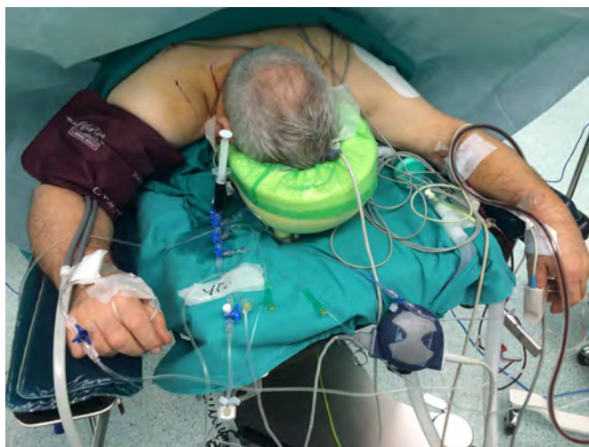
FIGURE 3. Central Methylene Blue Bolus.