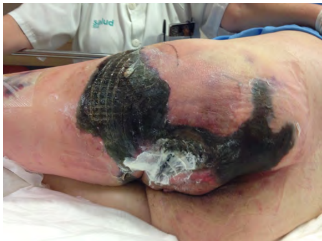
FIGURE 1. Decubitus Pressure Ulcer.

of about 40 cm in sacrum and trochanter (Fig. 1). After performing blood test, a leukocytosis 21,900/\mu\text{L} , renal failure with creatinine 2.26 and \text{K}^+ 6.3 mmol/L and procalcitonin > 40 ng/ml were evidenced, all compatible with septic features.