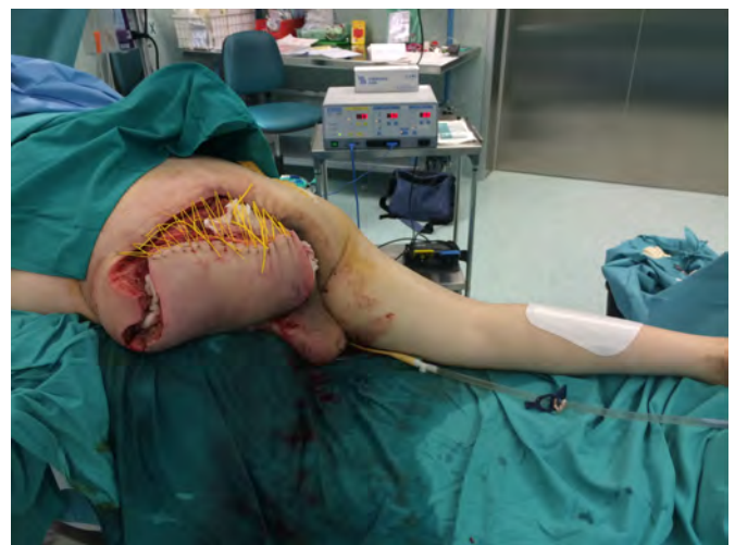
FIGURE 4. Amputation and Disarticulation of Left Coxofemoral Joint and Musculocutaneous Reconstruction.

cluded that methylene blue causes a transient effect and dose-dependent increasing cardiac output, MAP and SVR, although like Zhang et al. [20] demonstrated that high doses of methylene blue (5 to 20 mg/kg) worsened myocardial depression, and from 7 mg/kg may even compromise splanchnic perfusion [19].