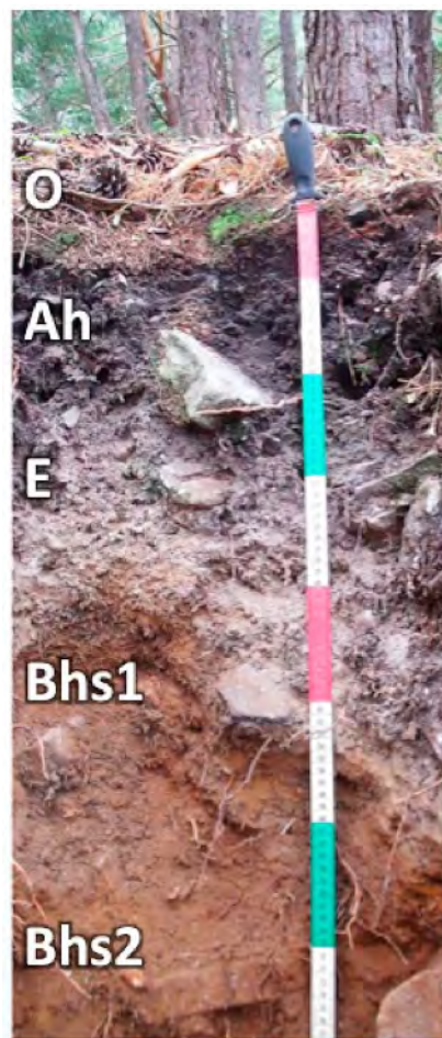
Figure 1. The studied soil profile.

1200 m to 1600 m above sea level. The latter grove was replaced by Scots pine ( Pinus sylvestris ) due to a reforestation around 1920 (García-Manrique 1960). The understory consists mainly of heathers ( Erica vagans , Erica arborea , Erica cinerea ), hollies ( Ilex aquifolium ), blueberries ( Vaccinium myrtillus ), wavy hair-grass ( Des-champsia flexuosa ) and mosses.