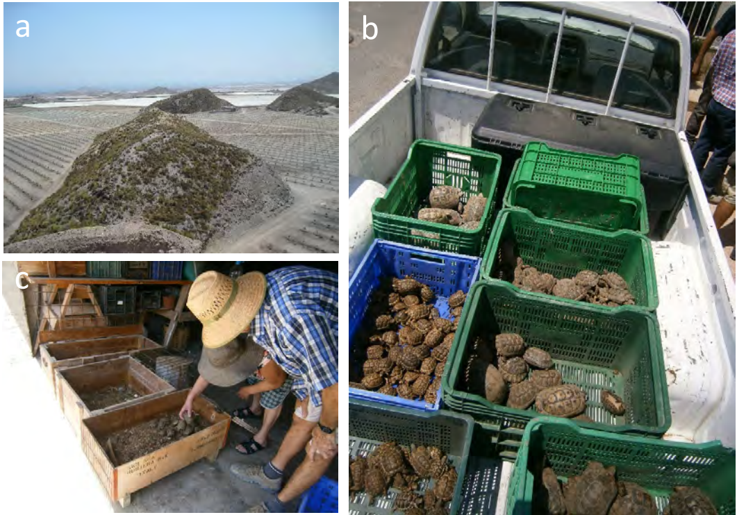
Figure 3: Threats to wild populations of Testudo hermanni (i.e. particular case of south-eastern Spain). (a) Habitat loss and fragmentation (Author: José Daniel Anadón). (b) Confiscated tortoises from local inhabitants in a single work morning of environmental rangers (Author: Eva Graciá). (c) Long-established custom of keeping and breeding tortoises in captivity (Author: Eva Graciá).

meeting constitutes a starting point. Further united efforts are needed to encompass the conservation of the two other Testudo species inhabiting the Mediterranean Region ( T. kleinmanni and T. marginata ). The conclusions of the workshop are shown below. Whereas the existing information has been considered when possible to elaborate these conclusions, we must highlight that no previously published information exists to support some of the asseverations below. In these latter cases, expert judgement coming up from discussion and agreement at the workshop was used to elaborate the conclusions.